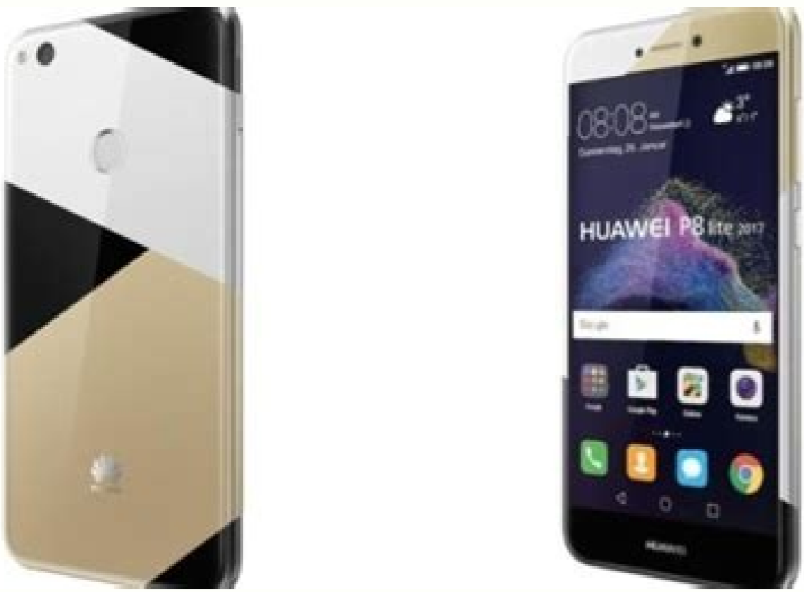
Huawei p8 lite aggiornamento android 7.